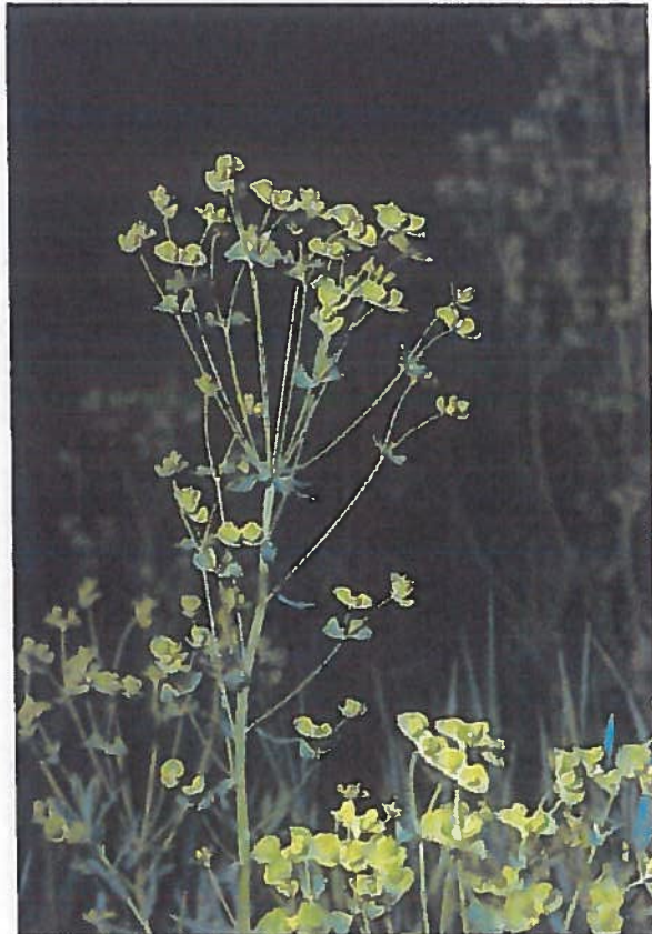
Leafy spurge.

Contributed by: USDA NRCS Aberdeen, Idaho Plant Materials Center